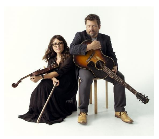
Watkins Family Hour Wednesday, January 19, 2022 at 8 p.m.

Founding members of Nickel Creek Sean and Sara Watkins created the Watkins Family Hour in 2002 as a side-outlet to try out original songs and a few covers that weren't quite right for the band. Now, returning to the studio as Watkins Family Hour, with Sean primarily on guitar and Sara on fiddle, and with both of them sharing vocals, the siblings harness an energy and honesty that can only be experienced live.