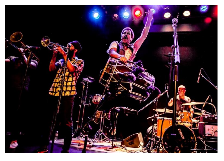
Red Baraat Festival of Colors Friday, April 21, 2023 at 8 p.m.

$45 orchestra / $40 balcony 1 / $35 balcony 2 / $15 student