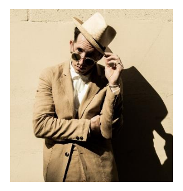
Pokey LaFarge Music of Howlin' Wolf

$50 orchestra / $45 balcony 1 / $40 balcony 2