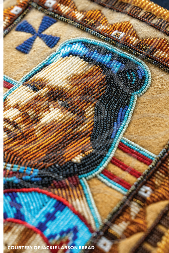
BREAD

Opening Reception: Friday, November 7 from 6:00 – 8:00 pm