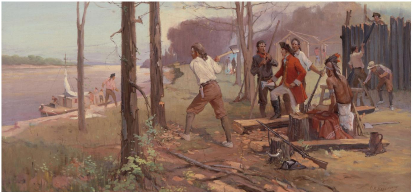
Oscar E. Berninghaus, (American, 1874–1952) Laclede Landing at Present Site of St. Louis, c. 1914 oil on canvas, 22 1/2 x 44 1/2 inches Saint Louis Art Museum, Gift of August A. Busch Jr. 272:1977